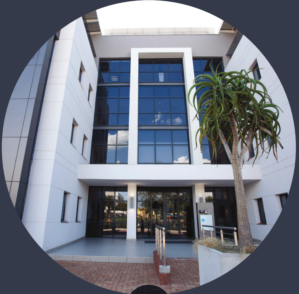
The Grid, Rivonia Road