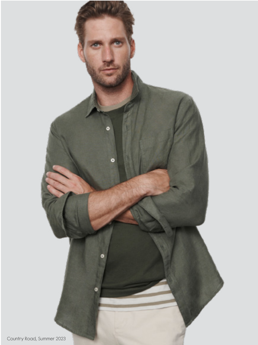
Country Road, Summer 2023