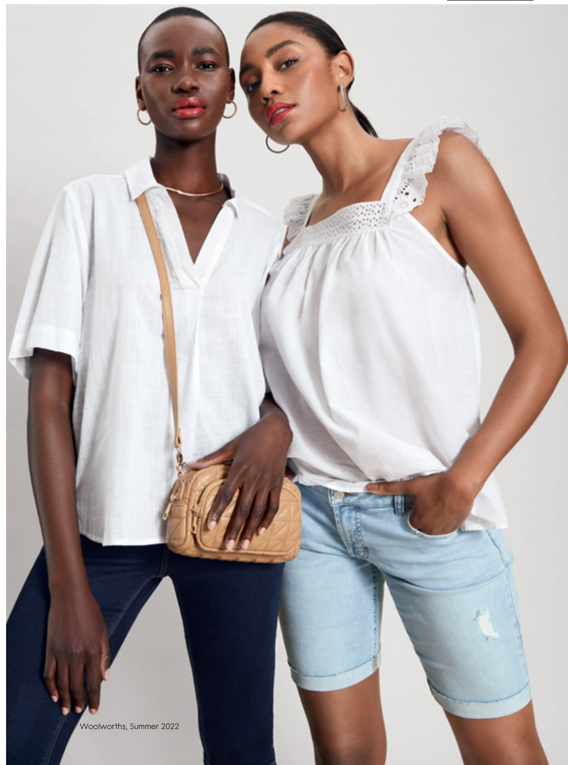
Woolworths, Summer 2022

The condensed consolidated interim financial statements have not been reviewed or audited.