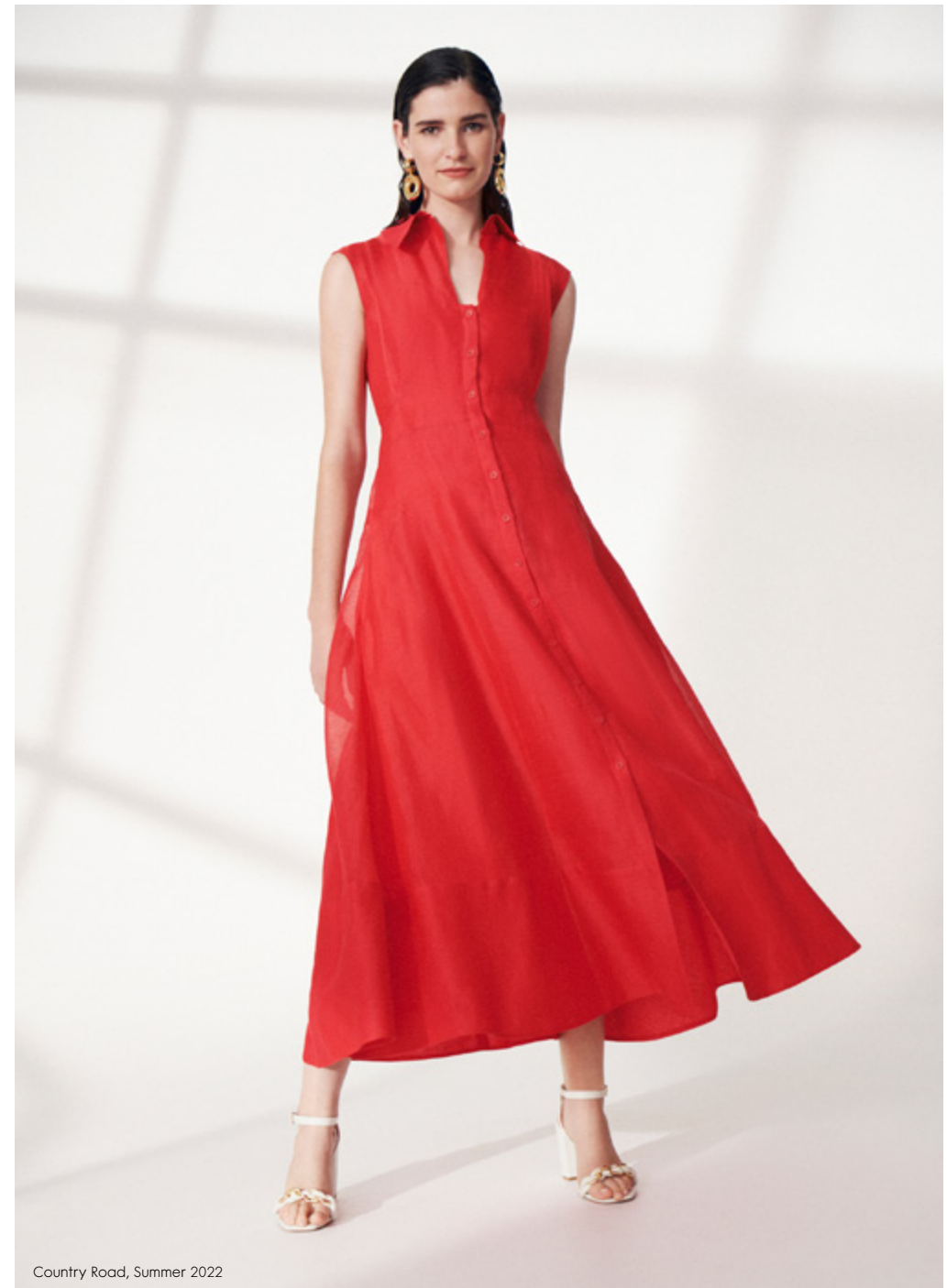
Country Road, Summer 2022